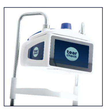
tearcheck® angled view