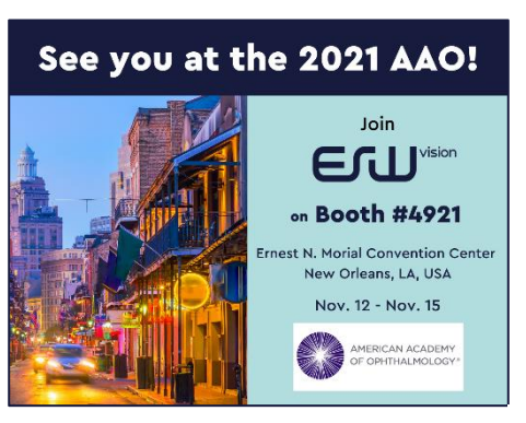
AAO 2021 announcement