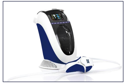
tearstim® angled view