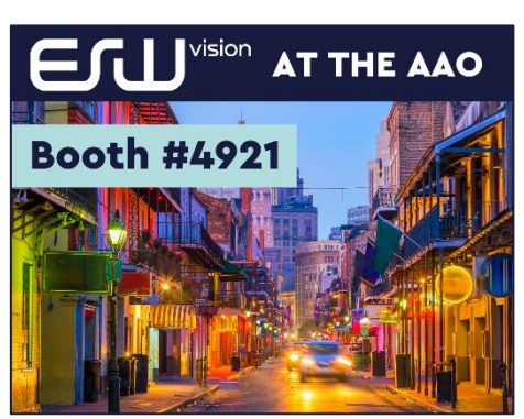
AAO 2021 booth location