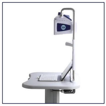
tearcheck® side view